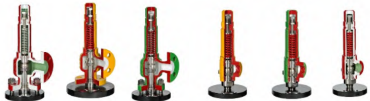
Model 3-5111 Flange

Flanges rating: Inlet 150 ÷ 1500# Outlet 150 ÷ 300#, ASME 16,5 Supplied with DIN flanges under request